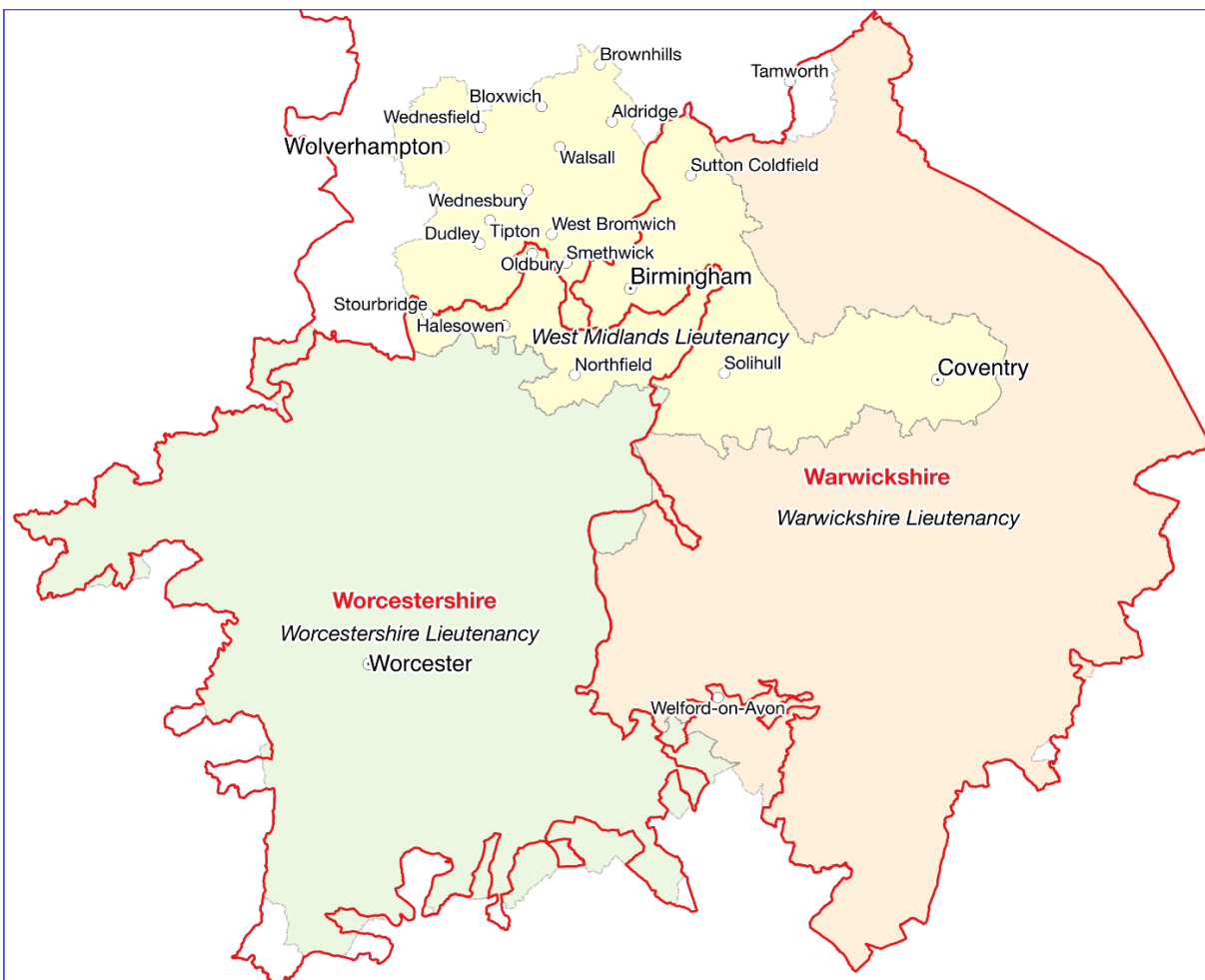
The Warwickshire, Worcestershire and West Midlands lieutenancy areas compared to the historic counties

The main threat to the identities of the historic counties is their confusion with local government. The Warwickshire County Council and ‘ Warwickshire ’ lieutenancy areas exemplify this problem.