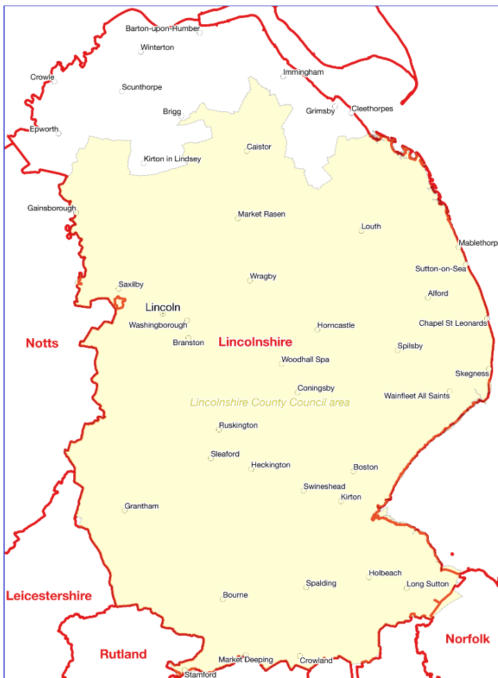
Lincolnshire County Council area compared to the historic county

The main threat to the identities of the historic counties is their confusion with local government. The current Lincolnshire County Council area exemplifies this problem.