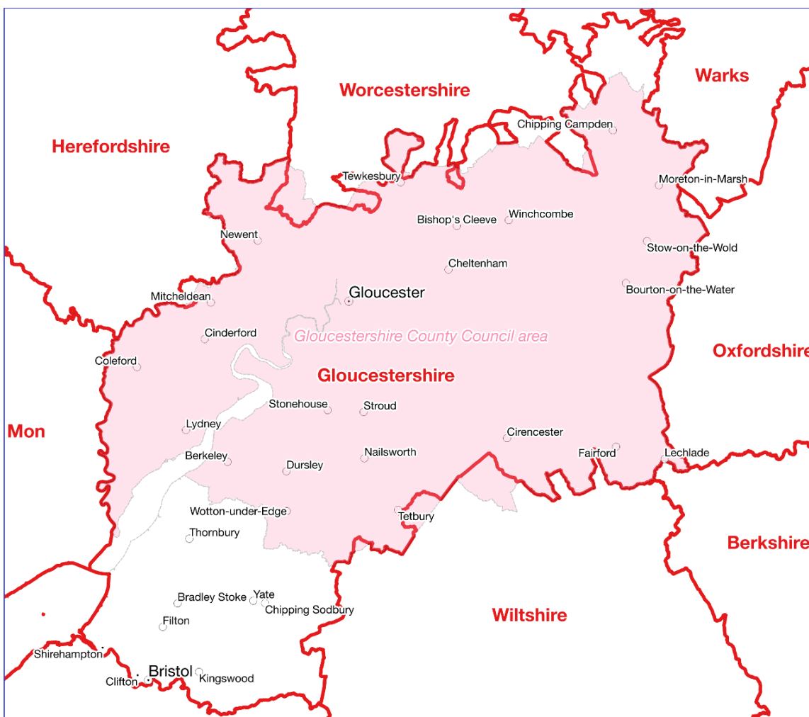
Gloucestershire County Council area compared to the historic county

The main threat to the identities of the historic counties is their confusion with local government. The current Gloucestershire County Council area exemplifies this problem.