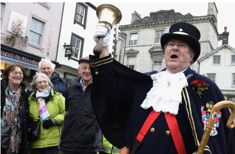
The Lancashire Day declaration being proclaimed in Ulverston

Westmorland and Furness Council could also encourage the parish councils within its area to join in the relevant county day celebration and to celebrate their historic county more generally. Appendix A lists the historic county of each parish in the council area.