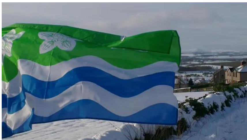
Cumberland flag at Beacon Edge near Penrith