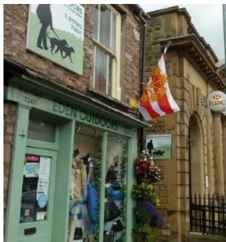
Westmorland flag in Kirkby Stephen

Yorkshire Flag - the white rose is the traditional symbol of Yorkshire and, placed on a blue background, has been the flag of Yorkshire for over forty years.